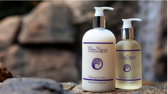
All treatment prices are on the last page of the menu.