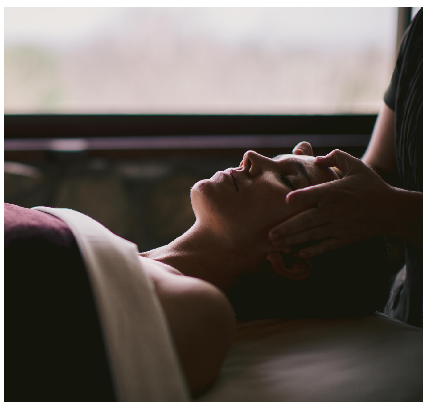
All treatment prices are on the last page of the menu.

Luxurious foot exfoliation, wrap and specialized massage, leaves your feet feeling like you've been wading through a mountain stream.