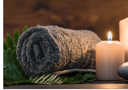
All treatment prices are on the last page of the menu.