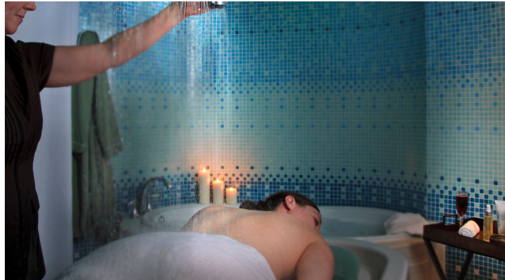
All treatment prices are on the last page of the menu.