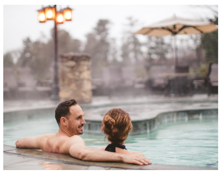
All treatment prices are on the last page of the menu.